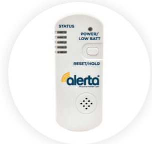
Alarm Monitor - Wireless