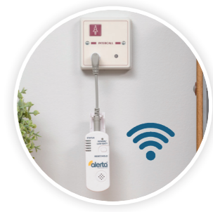
Wireless Option Available

Heavy duty floor mat provides a safe falls prevention solution with maximum longevity