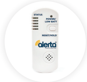
Alarm Monitor - Wireless