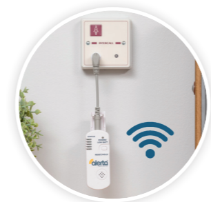
Wireless option available

Provides advanced warning of falls risk if patient leaves or attempts to leave bed