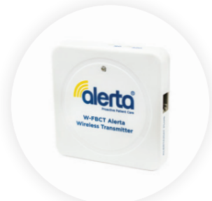
Alerta Wireless Transmitter

Soft padded mat helps to minimize serious injury in the event of a fall from bed Alerts carers if patient impacts with mat, whether due to an accidental fall or controlled exit of the bed Wireless connect-and-play system