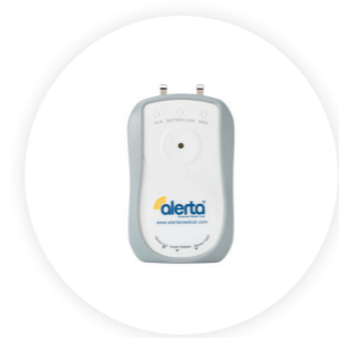
Alarm Monitor - Wired