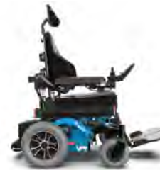
BLAZE BLUE - GREY HYBRID WHEELS (PNEUMATIC OR SOLID)