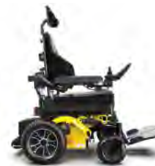
SUNRISE YELLOW - BLACK HYBRID WHEELS (PNEUMATIC OR SOLID)