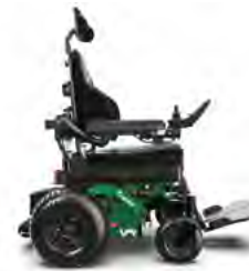
FOREST GREEN - BLACK AT WHEELS & RIMS