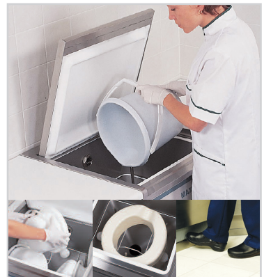
Easier Loading Greater Versatility