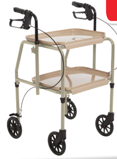
Aspire Meal Trolley (DLG272060)