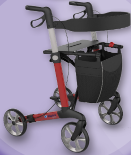
Aspire Vogue Walker Red - (WAF705300RE)