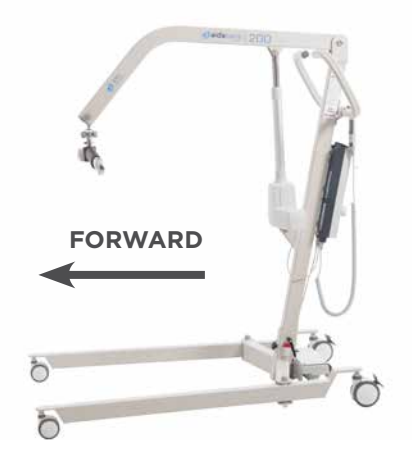
This is the direction of travel for which this lifter has been designed.

The correct and appropriate use of the ASPIRE 200 Lifter reduces the risks associated with manual patient handling. The lifting and transferring of patients should always be assessed and planned by a trained health professional.