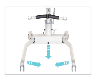
2. Pull the pin at the centre and close the legs.