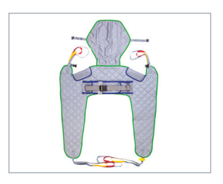
Deluxe Access/Hygiene with Head Support