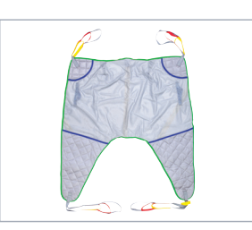
Mesh General Purpose