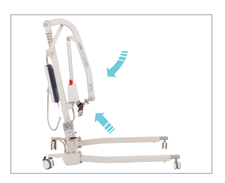
1. Bring the boom down and secure the handlebar on the wire harness.