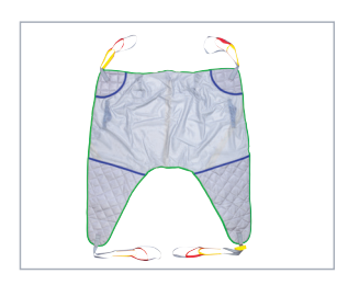
Deluxe General Purpose

This lifter may also be suitable for use with other brands of slings provided that the design is compatible with a hook yoke/spreader bar design. To confirm if a sling is compatible with any of the Aidacare Aspire range of lifters. contact Aidacare.