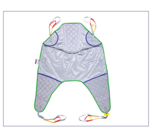
Deluxe General Purpose with Head Support