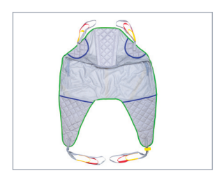
Mesh General Purpose with Head Support