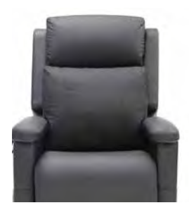
Classic Backrest CHP198290 - Medium CHP198295 - Medium CHP198310 - Medium CHP198291 - Large