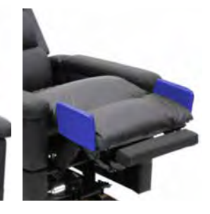
Channel Legrest CHP198320

*All accessories are black, blue highlights are used for identification only