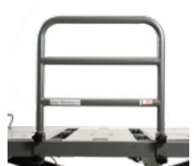
Clamp On Bed Rail BEA829105

*Only fits community beds with a side frame thickness of at least 50mm