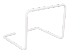
Fixed Bed Rail BEA013600