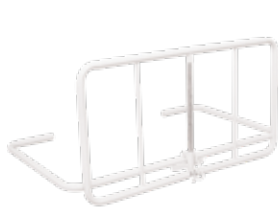
Drop Down Bed Rail BEA013700