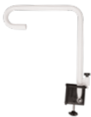
Clamp On Bed Pole BEA009300 & BEA009310