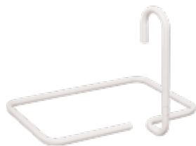
Bed Pole With Adjustable Crook Handle BEA014150