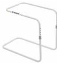
Adjustable Height Bed Cradle BEA014610