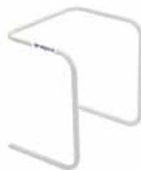
Fixed Height Bed Cradle BEA014605