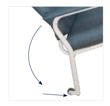
Transport Wheels CHP208090