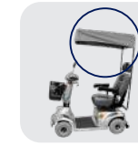
Sun Shade Canopy