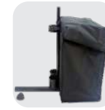
Rear Shopping Bag