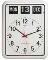
Jadco Calendar Clock BQ12 DCT100110