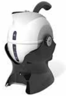
Uccello Kettle Tipper DLK276631 - Red / White DLK276635 - Black / White