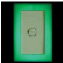
Glowing Surround Frame for Light Switches Various sizes available