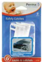
Cupboard Locks Internal DCO100235 - 6 Pack