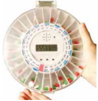
Tabtimer Automated Pill Dispenser DCO100175