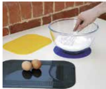
Dycem Anchorpad Various sizes and colours