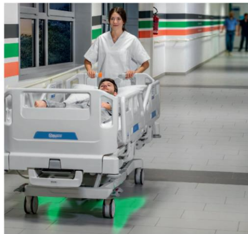
BEB050150 Delta 4 Ward Bed W/DeltaDrive & Weigh Scale