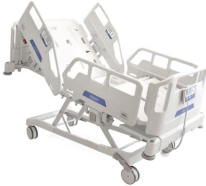
BEB050140 Delta 4 Ward Bed