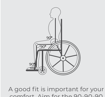
comfort. Aim for the 90-90-90 rule for good positioning in your wheelchair