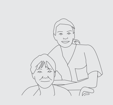
Liaise with your healthcare professional to learn how to safely use your wheelchair.