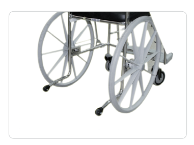
Anti Tip Bars