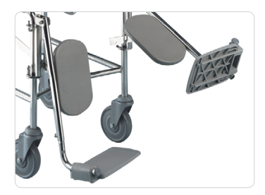
Elevating Legrest Right Available in Left