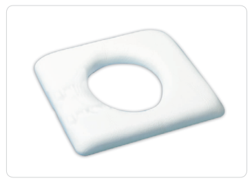
Hand Made Closed Seat Available in various sizes