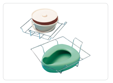
Pan Carrier & Bed Pan