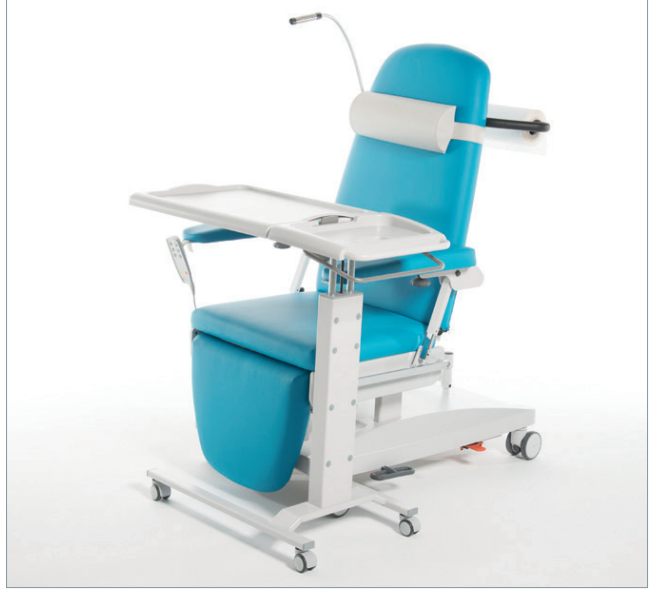
Perfect for combining with the MULTILINE NEXT DC and IT (IT shown here)