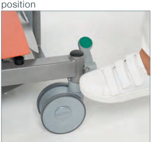
Central locking/directional stability