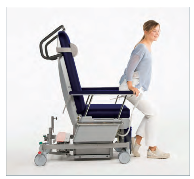
Patient-friendly access at heights of 580-900 mm

GREINER gives you the opportunity to individualise treatment couches according to your precise needs. For example, you can choose your preferred upholstery colour from the broad colour chart. Covering materials, which have a biocompatible surface, are resistant to urine and blood, scratch-proof, heat resistant and impervious to disinfectants and soiling. Equipment and accessories are designed with attention to detail.