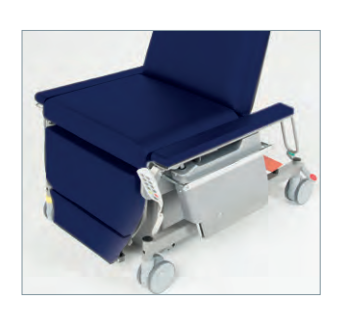
Fully retractable armrests