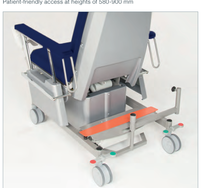
Ease of access to powerful rechargeable battery