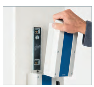
Wall charging point