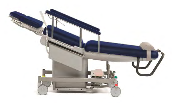
Trendelenburg and shock position