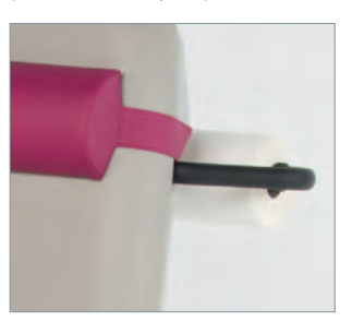
Handle with paper roll holder