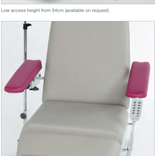
Five-position padded armrests with attached remote control