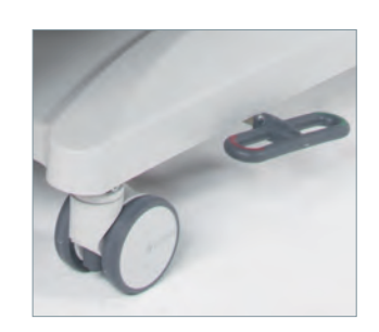
Central braking system