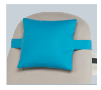
Comfortable pillows as standard