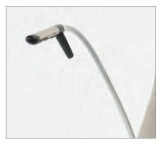
LED reading light (available on request)