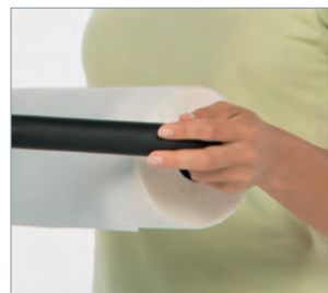
Handle with paper roll holder