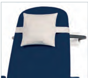
Head rest as standard