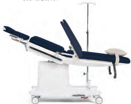
Trendelenburg and shock position