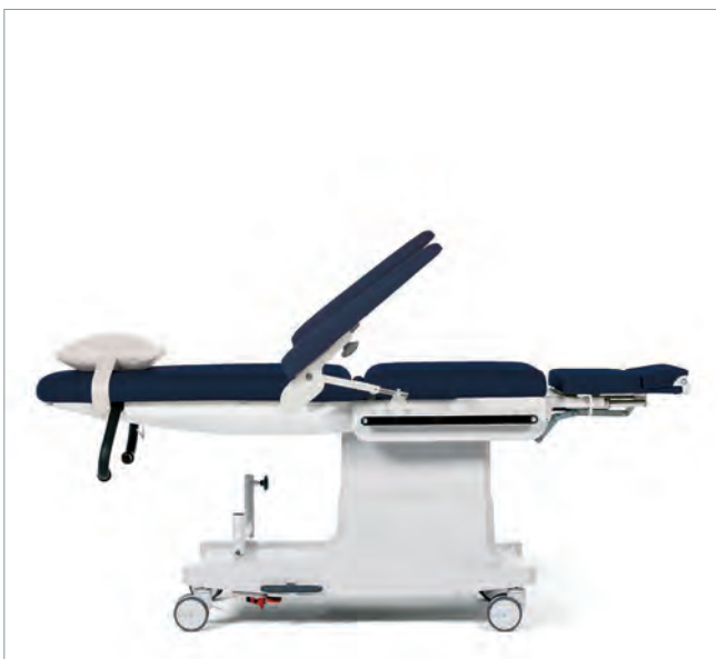
Low-level access from the front and side

GREINER treatment couches are supplied with many inclusions as standard, however can be tailored to your precise needs. Premium covering materials and upholstery offer extra-soft, wear resistant surfaces; a dynamically flexible suspension system within the seating surface supports freedom of movement for the spine, pelvis and hips, thus relieving pressure to the benefit of patients. Innovative MULTILINE five-position armrests, the first to move in five directions, are setting new standards.