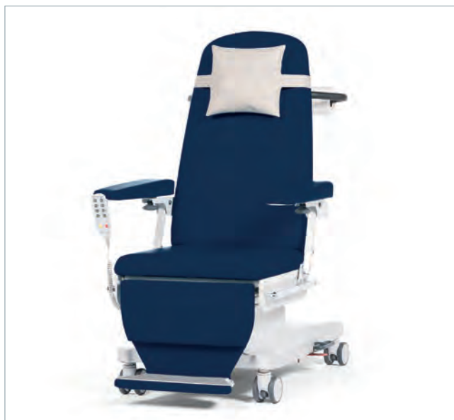
Unique armrest technology with patient-friendly positioning