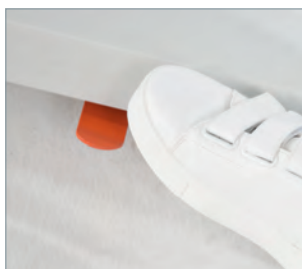
Emergency foot switch