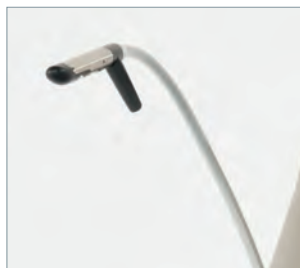
LED reading light (available on request)