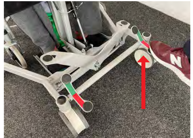
4.Apply the brake by stepping on the red Brake Pedal