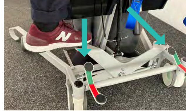
Check that the legs are spread open to fit around the chair

To spread the legs of the Kera sit2sit, press down with your foot on the end of the Leg Spreader Lever. This ensures the legs will fit around a chair