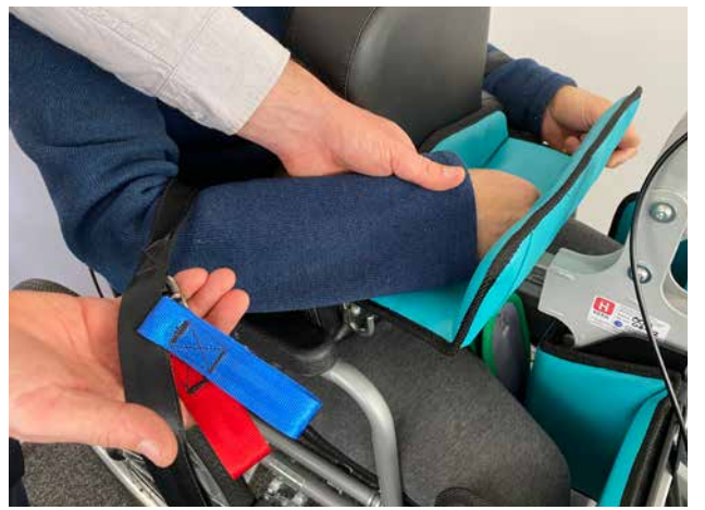
One at a time, bring the straps underneath the arms of the user

Have the user lean back in their chair to keep the Backstrap in place