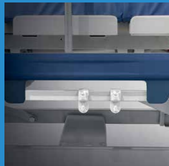
Accessory-holder side bar.

Thanks to its small size , the ONEday stretcher can be placed and moved through passageways and small stretcher lifts.