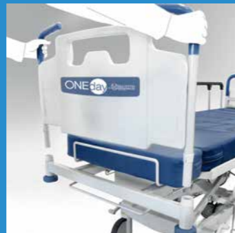
Quickly removable end-panels for emergency procedures.