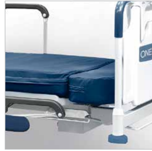
Code: BEM050300 Static Mattress w/Extension Bolster