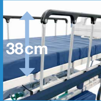
Integrated folding side rails.