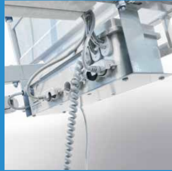
Battery backup as standard for use in the event of a power outage or when manoeuvring around wards.