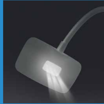
Integrated night light at the rear of the attendant control panel.