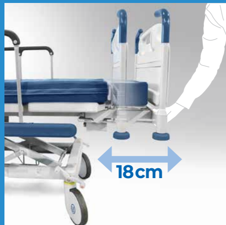
Bed extension which increases length by up to 18cm.

The mattress platform can be lengthened up to 18 cm, thanks to an integrated bed extension which can be operated with one hand.