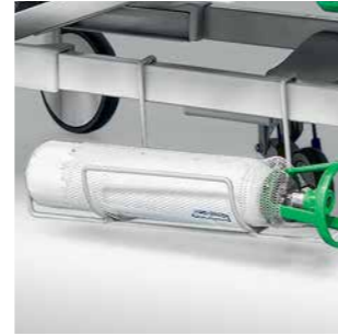
Code: TSE674110 Oxygen bottle holder.