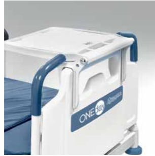
Code: TSE674120 Tip-over monitor tray/writing desk.