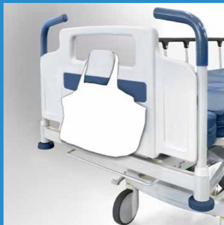
Bed ends can hold air mattress pumps, patient charts or belongings.