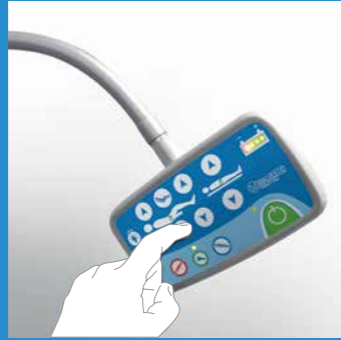
Satellite attendant control panel with intuitive push-button design.