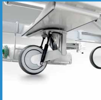
Centrally located fifth castor for U-turns and effortless manoeuvres.