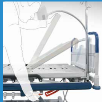
Emergency CPR levers for use during an emergency.