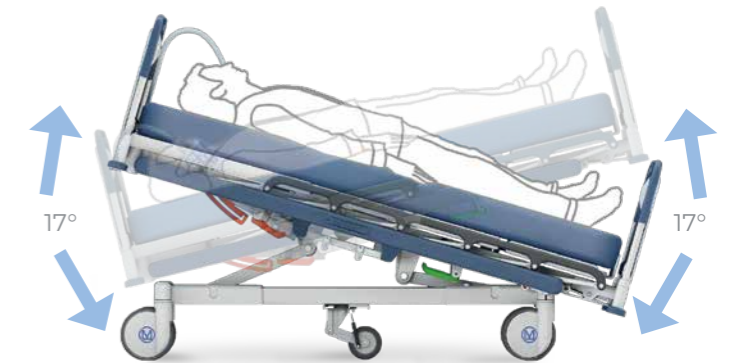
Trendelenburg and reverse-trendelenburg position.

The cardiac chair position with integrated auto-regression helps to minimise respiratory complications by reducing pressure on the plexus/pelvic area.