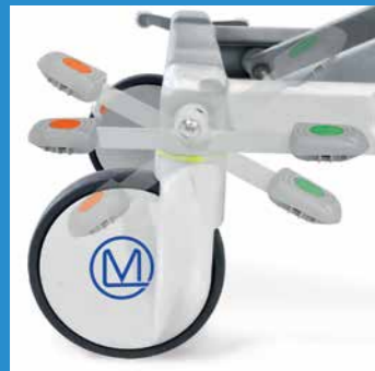
200mm anti-static castors.