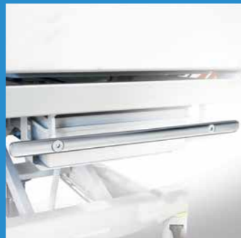
Normalised steel bar to support medical ventilators.