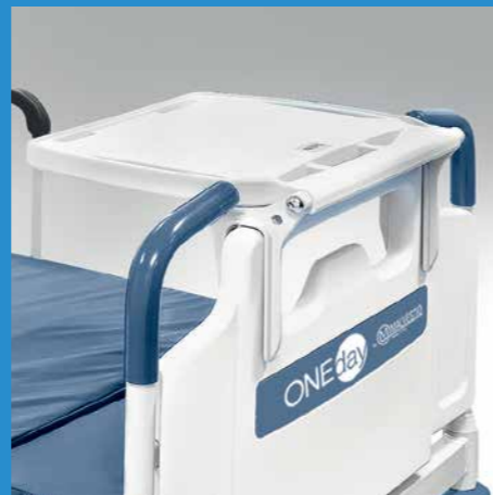
Code: TSE674120* Tip-over monitor tray/ writing desk.