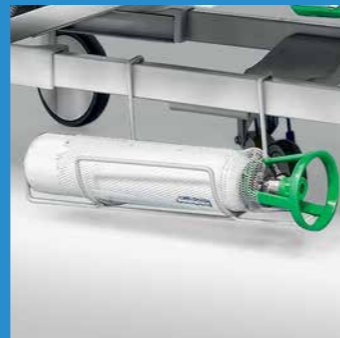
Code: TSE674110* Oxygen bottle holder.