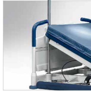
Code: TSE674130 Telescopic IV Pole