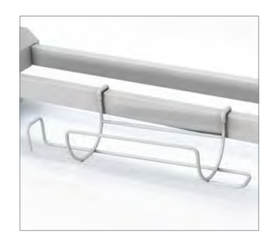
Code: PED490120 Oxygen Bottle Holder