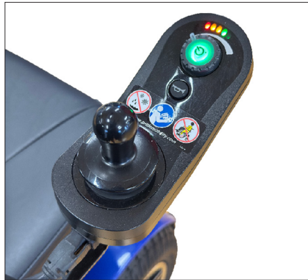
Dynamic Linx Joystick Controller