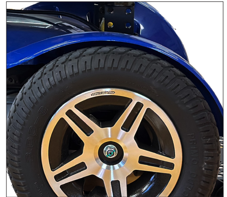
14" Solid Front Drive Wheels