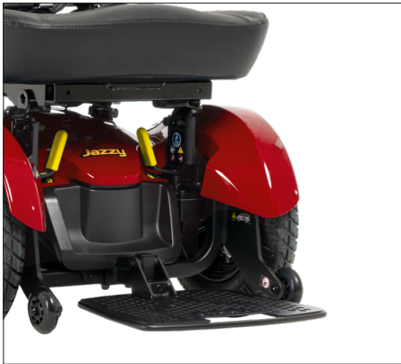
Flip Up Foot Board