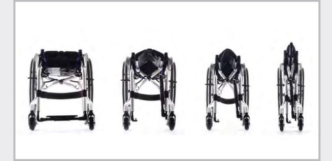
The aluminium latches on the cross-brace will also keep your wheels in parallel when folding and makes sure the chair stays folded when lifting.