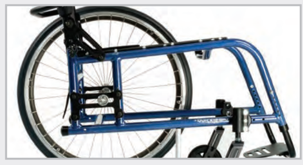
The GP's classic box frame and one piece construction exceed our superior standard for quality and deliver an unmatched rigid feel.