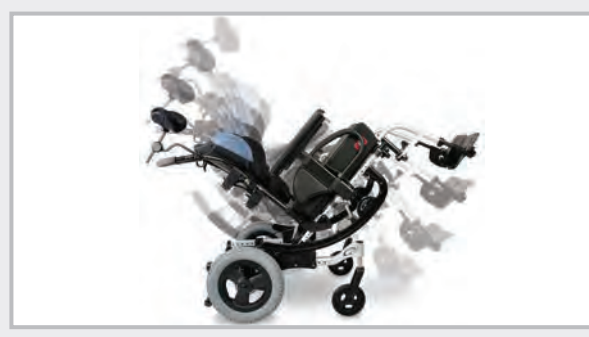
The Quickie IRIS features up to 55° of Intelligent Rotation in Space Technology to achieve superior positioning and is designed to facilitate feeding and respiratory function, reduce pressures and improve visual alignment.