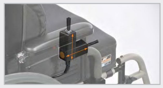
Can be mounted vertically or horizontally depending on needs. Charging port is conveniently located on the toggle switch for easy access.