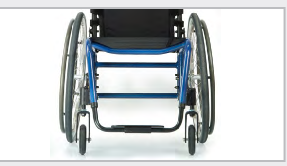
The tapered GPV front frame, optional Quickie Performance wheels, and up to 12° of wheel camber combine for exceptional maneuverability on and off court.