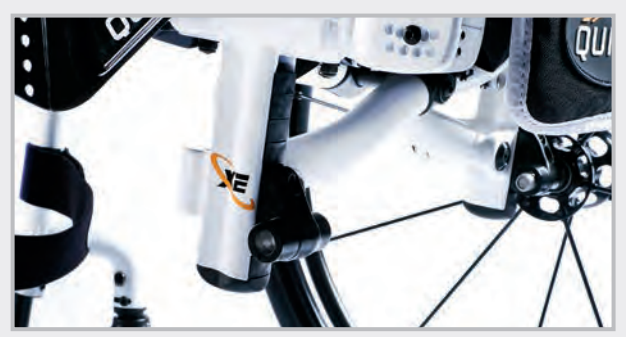
You want to change your chair driving characteristic from passive to more active or the opposite way? Just change the centre of gravity setting by simply repositioning the axle stem. And don't forget to adjust the back angle for your ergonomic posture.