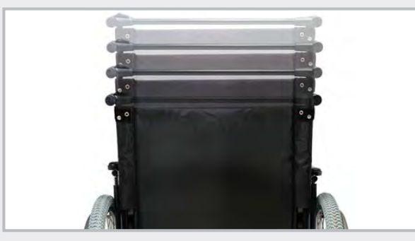
The M6's modular frame, features high strength steel for increased durability. Its interchangeable, heavy duty components accommodate changing conditions with simple parts replacements.